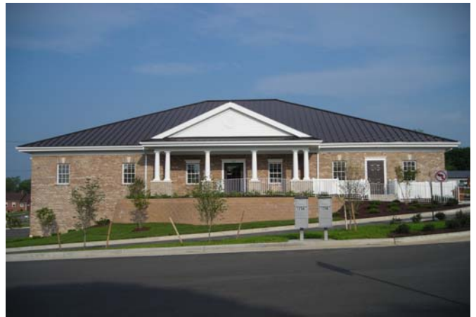
The new Municipal Building located at 125 Eastview Street.

Festivities are also being planned for town residents by town officials. A Hot Dog Social is scheduled in June ( see article on page 2 ) and an Ice Cream Social will be held in August.