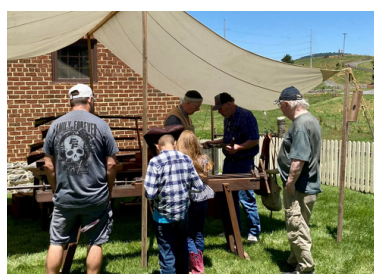
Silver Lake Mill hosted Old Fashioned Milling Day on May 21. Pictured here are attendees watching fresh corn meal be made! demonstration!