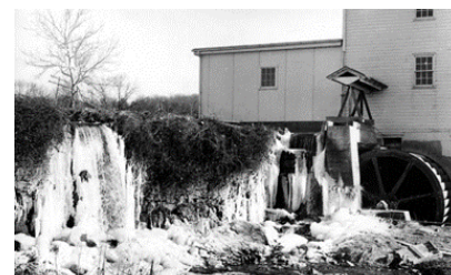
Freezing the millwheel in 1960.