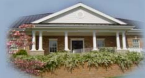
Dayton Municipal Building